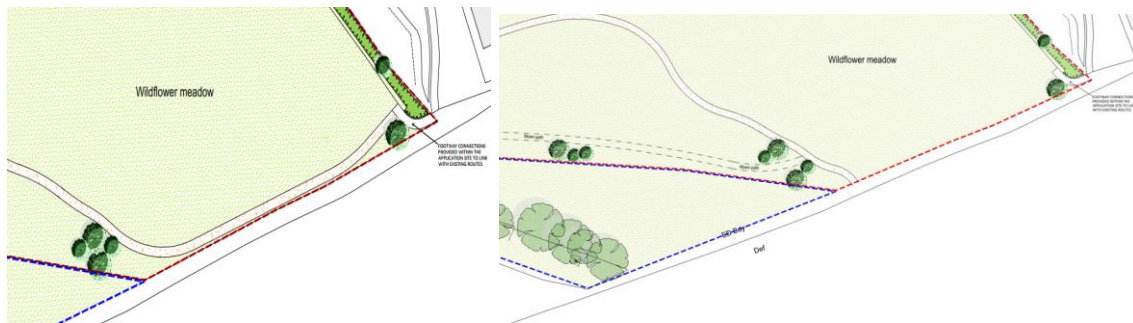
Original layout (left) and revised connection to BRIT8 footpath (right)

to the north via a new footpath link to the east, see plan below. It is considered that this pathway linkage should be secured as part of the public open space matters in the S106.