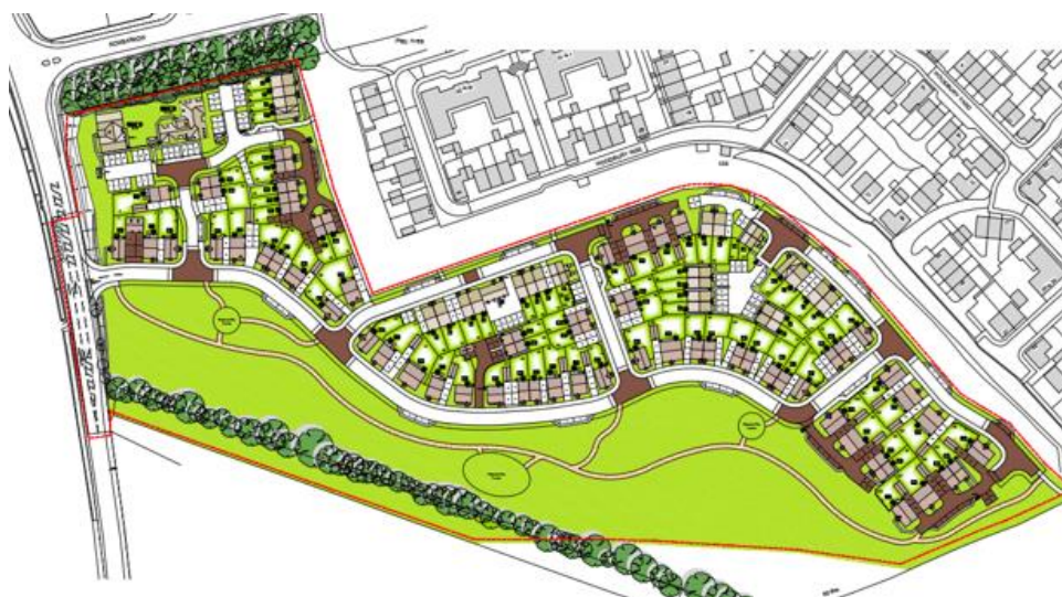
ORIGINAL 108 DWELLING SCHEME

As indicated elsewhere in this report, this proposal was originally submitted for 108 dwellings, with open space to the south. The original submitted layout is below: