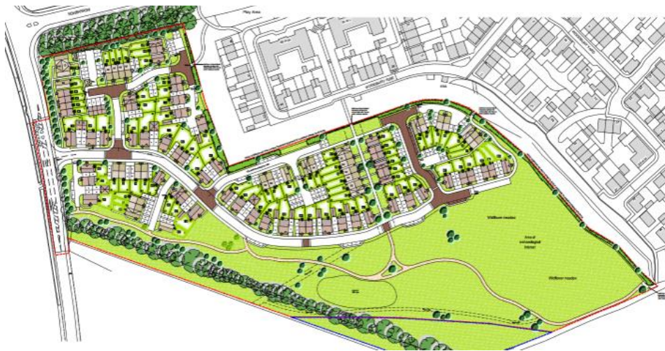
Scheme reduced to 95 dwellings (first version)

Consequently, a further layout was submitted which reduced the scheme to 95 dwellings, and moved the dwellings further away from the tree belt, as below: